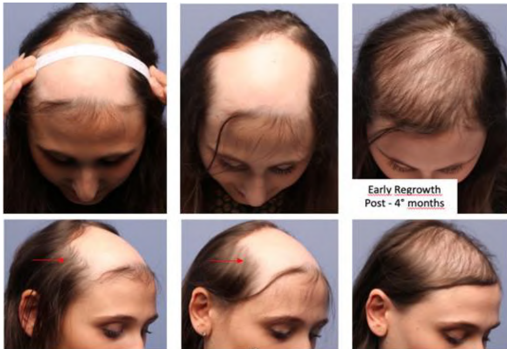
Figure 5: Woman, 27-year-old, Scalp scar related to radiotherapy for osteoid osteomas bone metastases. Two AFT session respectively 15 and 22cc. Area size 75 cm 2 . Total Donor Capacity 13.000 UF, Placed = 2660 UF. Density 35 UF/cm 2 . CV after transplant (24 x 2,73 x 0,066) = 4,32. Red arrow indicates the quality improvement of the hairs at the border of the lesion. This early and homogenous regrowth is a common feature of the vast majorities of our cases. Before (left), After 2 session AFT (center) 4 months after strip hair transplantation (right).