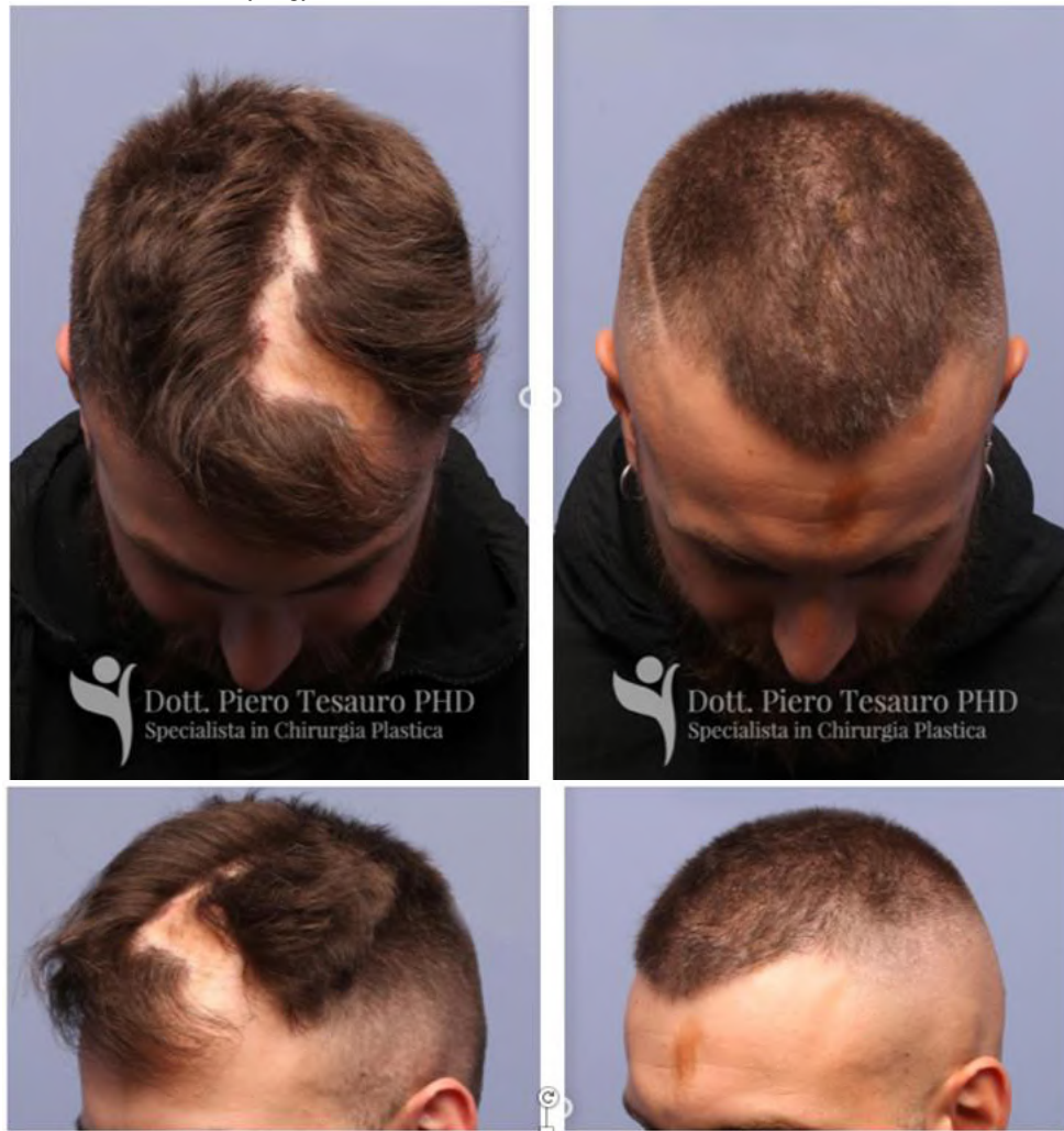
Figure 2: Man, 31-year-old. Childhood scalp burn by hot water. Two AFT session respectively 10 and 14cc. Area size 30 cm 2 . Total Donor Capacity 11.000 FU, CV of the areas close to the scar = 10. FU Placed = 1427 UF Density 47 UF/ cm 2 . CV after transplant = 7,4. Before (left), 2 AFT and 9 months after a single FUE hair transplantation (right).

and positive actions and has often been the premise of excellent and stable results. The contrast with the past, characterized by interventions without preliminary regenerative operations, has represented for the authors a perfect litmus test based on which it is possible to state here that the benefits of these procedures are clear and evident.