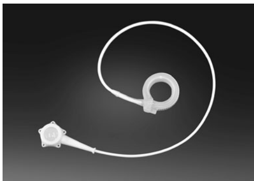
Fig. 1 This figure shows the complete Bioring device. The Bioring is connected by a tapered connector with a “trumpet end” to a low-profile, large septum access port

Between March 2003 and March 2010, 316 consecutive patients benefited from the laparoscopic implantation of a Cousin Bioring in our department. At the time of writing this paper, 169 patients had been operated on for 5 to 7 years with a mean of 69 months. In this group, the male-to-female ratio was 42/127. Body mass index (BMI)